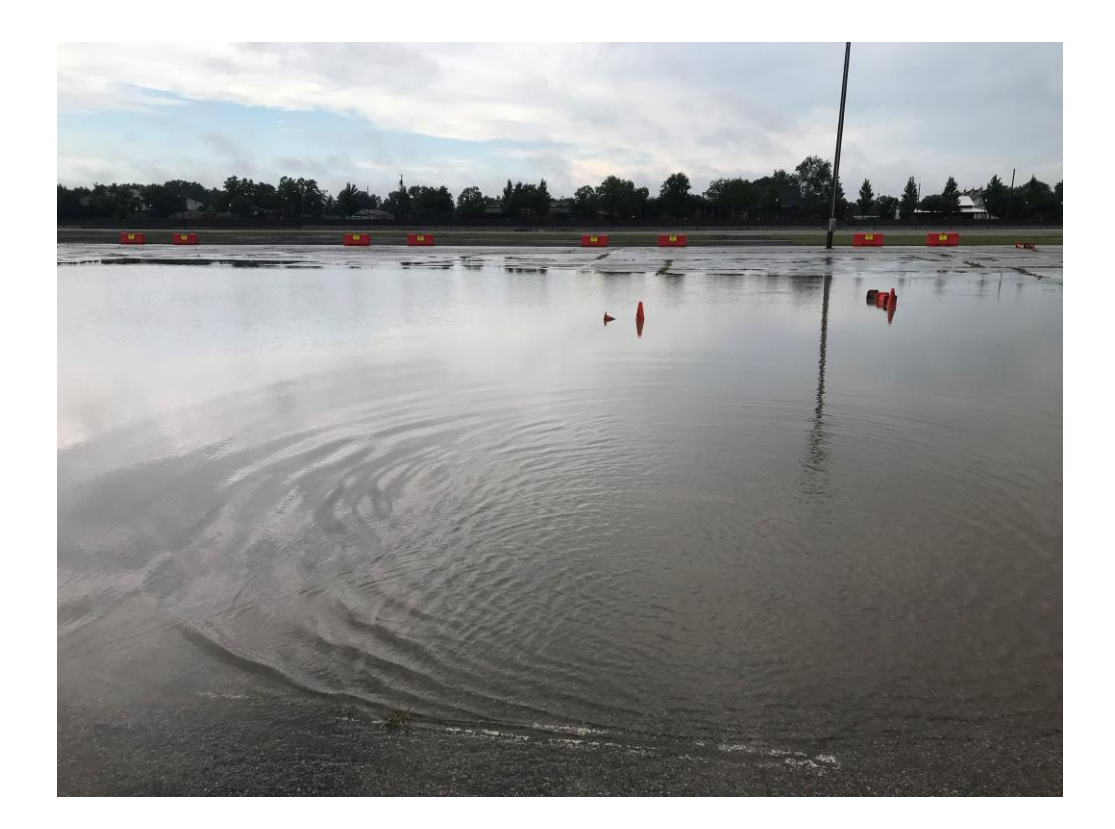
On July 8<sup>th</sup>, the Fair Grounds Solo site after it stopped raining